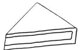
slice of pie